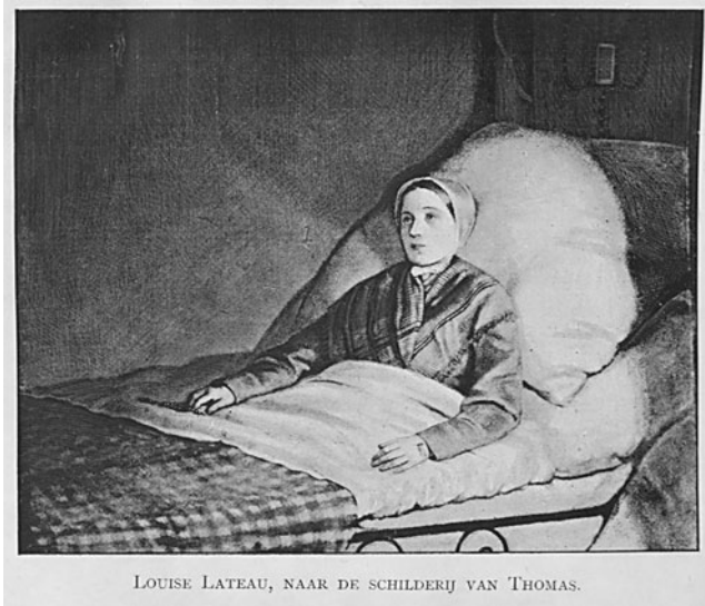
Figure 6. Drawing based on the larger painting by Alexandre Thomas: Riko, Louise Lateau en andere mystieken , frontispiece.

made it into the public realm were just like the photographs of Bernadette, each one ‘a safe and controllable image’. 59 In fact, those involved in the 1877 affair seem only to have distributed the ‘natural’ photographs among their friends. 60