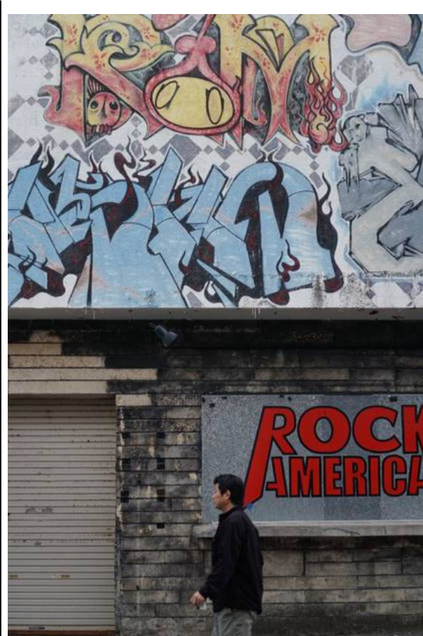
Entertainment district outside a U.S. military base in Kin, Okinawa, 2017