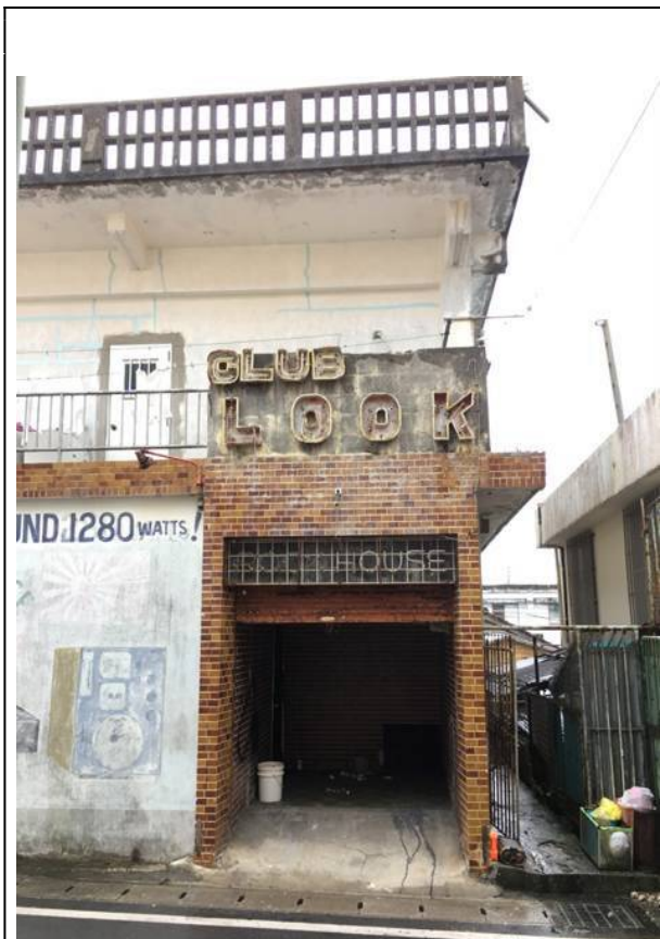
Entertainment district outside a U.S.