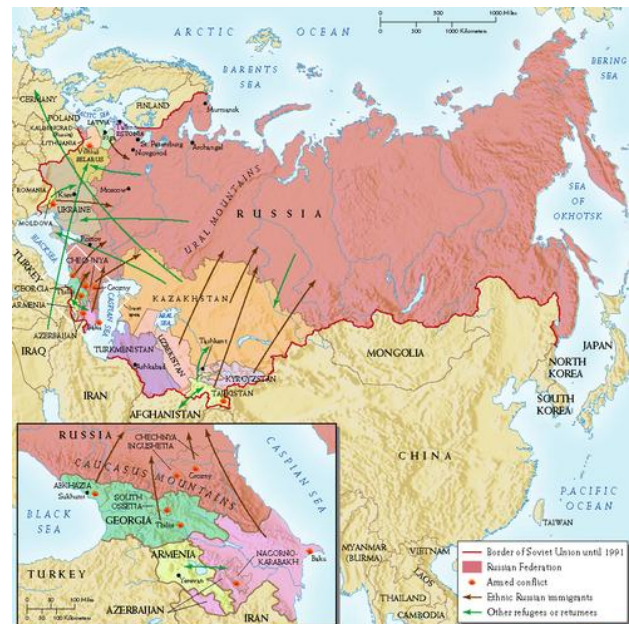
After the Soviet Union

As a result of the Soviet breakup in 1991, Russia, a state bearing every nuclear and other device of mass destruction, virtually collapsed. During the 1990s its essential infrastructures--political, economic and social--disintegrated. Moscow's hold on its vast territories was weakened by separatism, official corruption and Mafia-like crime. The worst peacetime depression in modern history brought economic losses more than twice those suffered in World War II. GDP plummeted by nearly half and capital investment by 80 percent. Most Russians were thrown into poverty. Death rates soared and the population shrank. And in August 1998, the financial system imploded.