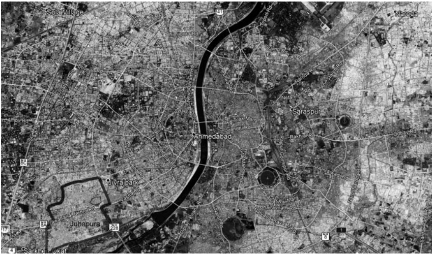
Map 1. Aerial view of Ahmedabad city. Highlighted in the southwestern corner is the border of the Muslim sub-city of Juhapura and, within it, the area of the first settlement of Shanklit Nagar.

in which these people moved and lived their lives have blurred boundaries that often elude the control of public administrations. For this reason, they are considered illegal, temporary, or illegitimate, something that lies outside the development trajectory of the city.