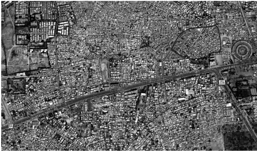
Map 2. Aerial view of Juhapura: the borders of Shanklit Nagar are delineated to highlight the geometric and ordered structure of the Integrated Urban Development Project of 1978.

residents of riverfront slums, after the heavy flooding of the Sabarmati River had wiped out their homes in 1973. The AMC thus had the double intent of providing new homes to thousands of displaced people and getting rid of slums that were located in the very centre of the city along the riverbanks. 60 The ‘Integrated Urban Development Project’ was then launched as a pilot and innovative initiative in the area known as Shanklit Nagar: the project was advocated by two local NGOs—the Ahmedabad Study Action Group (ASAG) and Saint Xavier’s Social Service Society (SXSSS)—along with the AMC in order to relocate 2,250 families living in 20 different clusters on the Sabarmati riverbanks. Interestingly, there is a higher representation of Muslims in Shanklit Nagar (44 per cent) than in the city as a whole (15 per cent), which could tell of both the greater backward status of Muslims in the city and of the fact that the area became a privileged destination for the