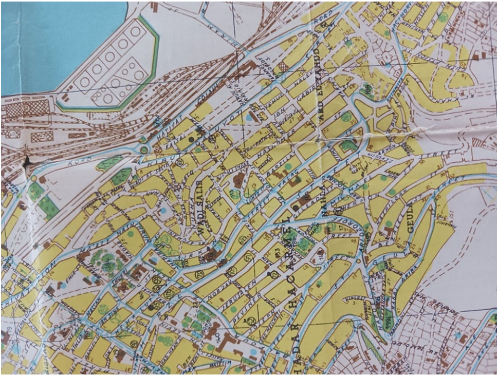
Figure 2. Map of Wadi Salib, Hadar HaCarmel, and Ard al-Yahud. University of Haifa Map Collection, Map 2-R-Haifa-A-12-1956/I C.2.

synagogues, which served as social institutions as well as houses of prayer, operated alongside cafés, craft shops, and stores, particularly along Stanton Street. 46