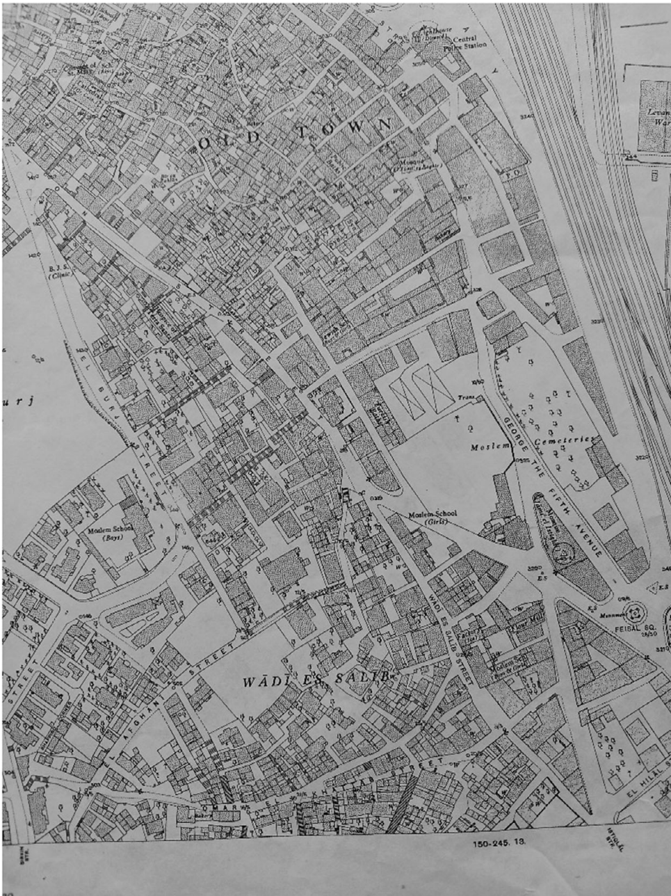
Figure 1. Map of Wadi Salib and the Old City (Harat al-Yahud is the area around the synagogues marked within the Old City).

the focal point of the Jewish population shifted to the area around Hashomer Street, to the east of Wadi Salib.