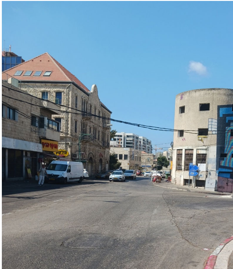
Figure 5. On the right is the abandoned Hadar Cinema. The cinema is located on Kibbutz Galuyot Street (formerly Iraq Street), which connects Wadi Salib to Ard al-Yahud. At the left edge of the photograph, a new residential project at the corner of Wadi Salib and Omar ibn al-Khattab Streets illustrates the change that the neighborhood is undergoing.

intellectual defects at the individual level. Additionally, in keeping with prevailing attitudes in the behavioral sciences at the time regarding Mizrahim, the committee found that “profound contrasts between the civilization of the country of origin and that of the country of migration” created an acute confrontation between opposing cultures. 113 This, in turn, led to “the inability of the young person to adapt to modern civilization, with its tensions and prohibitions.” 114 Against the backdrop of these discussions, and as a result of the Wadi Salib protest, the Youth Law (Care and Supervision) was enacted in July 1960. The law was intended to ensure supervision and oversight of children and youth who threatened the social and political order, and was a response to the phenomenon of vagrancy, children engaged in peddling, and those suspected of criminal activities. 115