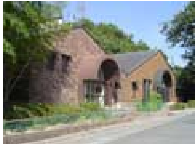
Okunoshima Poison Gas Museum, site of poison gas production during the Pacific War

Many public local museums as well as private museums, both large and small, were opened or renovated from the late 1980s on. They commemorate not only the sufferings of Japanese war victims, but also the losses and hardships of non-Japanese. These museums include the Okunoshima Poison Gas Museum in Hiroshima prefecture(1988), the Osaka International Peace Center (1991), the Kyoto Museum for World Peace at Ritsumeikan University (1992), the Kawasaki Peace Museum (1992), the Peace Museum of Saitama (1993), the Hiroshima Peace Memorial Museum (1994), Oka Masaharu Memorial Nagasaki Peace Museum (1995), and the Nagasaki Atomic Bomb Museum (1996). In addition, a number of “mobile peace museums” — that is, special exhibitions that underscore Japanese wartime atrocities—traveled across Japan and attracted tens of thousands of visitors.