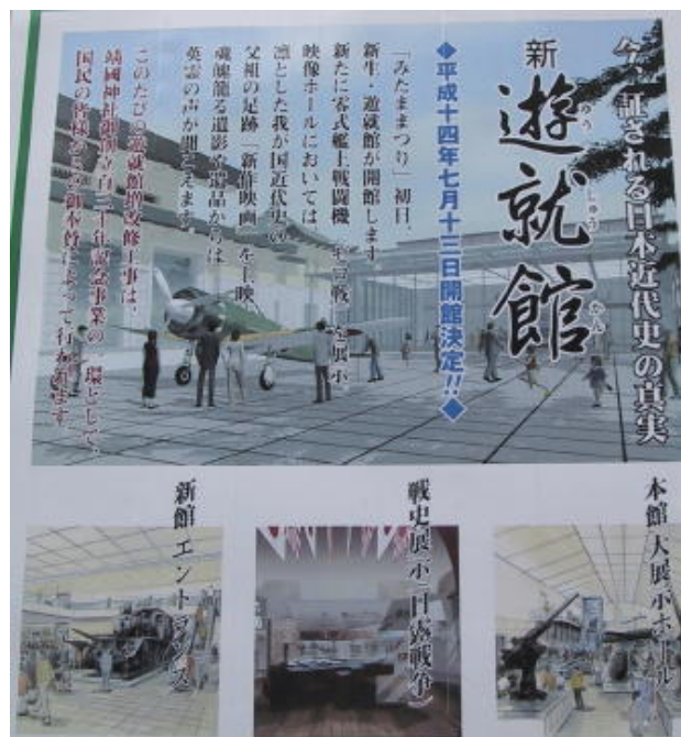
Yushukan war history exhibits at Yasukuni Shrine

restore the reputations of two Japanese officers who, in 1937, were reported to have engaged in a contest to see who could kill more Chinese in what came to be known as the 100-man beheading contest. The divisions are not only those between nations. They are also played out within Japan. Since its foundation in 1984, the Research Committee on the Nanjing Incident (Nankin jiken chosa kenkyukai) has published in-depth studies documenting the atrocities in Nanjing. In contrast, the Japan Association for “Nanjing” Studies (Nihon “Nankin” gakkai) has zealously published revisionist accounts denying the NM since its founding in 2000.