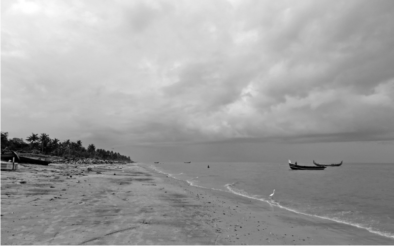
FIGURE 1.3 Photo of a mudbank with characteristically calm waters at Punnapra about 3 miles north of Alleppey. August 2018.