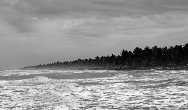
FIGURE 1.4 Photo taken from an adjoining beach showing the usual state of the sea during the monsoons on the Malabar Coast. August 2018.