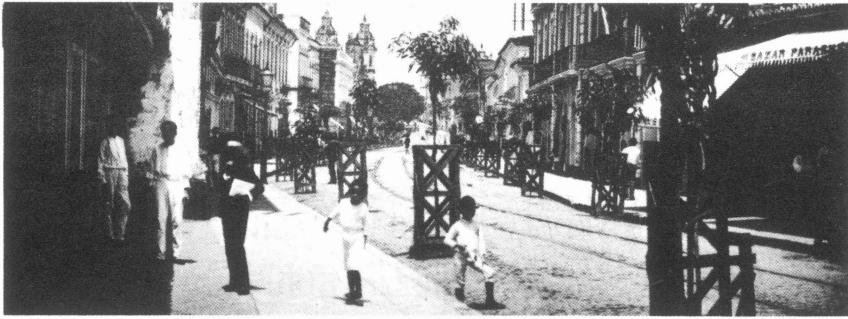
Photography in Brazil