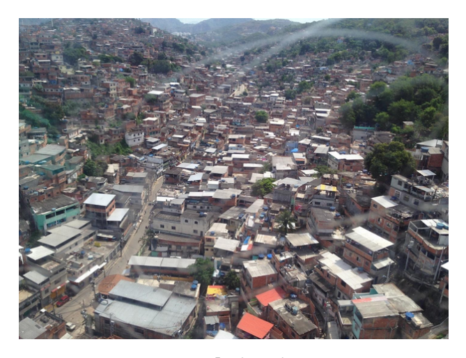
Favela in Rio

The Olympics took place largely in the south and west of the city, which is largely white and well-off. The rest of Rio is a hodgepodge of dilapidated factories, hillside slums, and some prosperous pockets with the threat of violent crime around any corner. Crime was mostly hidden away during the Olympics but spiked afterward, driven by a grinding recession and stepped-up security that vanished after the games ended.