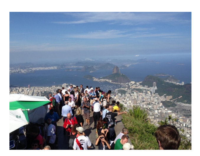
Glorious Rio viewed from above

The Olympics and the World Cup were supposed to focus attention on the problem and help solve it. In Rio's Olympic bid, it promised to improve the situation. It didn't. "It was a wasted opportunity," Mayor Paes, in a few moments of candor, acknowledged more than once. It was a problem the IOC overlooked, and often defended. A year before the Olympics opened, Nawal El Moutawakel, a gold-medal Moroccan hurdler in 1984 who headed the IOC inspection team for Rio, was asked if she would swim in the bay.