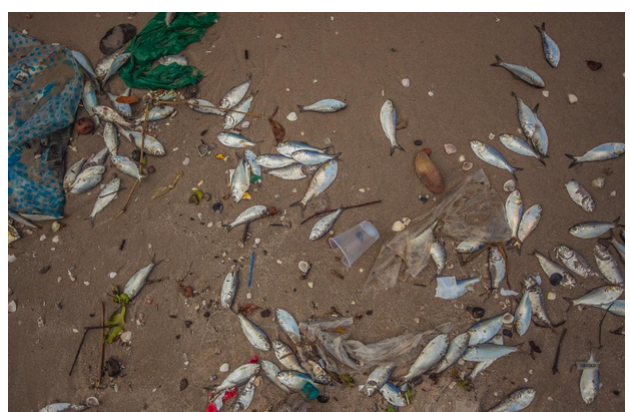
Rio's Toxic Tide

Sailors talked openly about seeing dead animals floating in the water, maneuvers to dodge water-logged sofas, and joked with black humor about "the science" of untangling plastic bags from rudders and center boards.