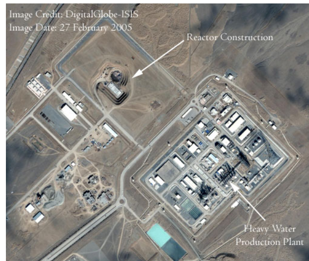
Arak heavy-water plant in 2005 satellite image

and as evidence that "Iranians are ready to give the IAEA exhaustive answers".