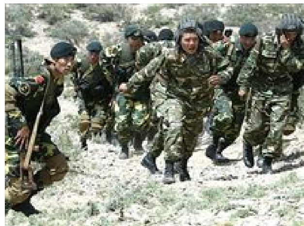
SCO military exercise in Kyrgyzstan

Volga-Ural military district and in Urumqi, capital of China's Xinjiang Uyghur autonomous region. The SCO summit is scheduled to take place in the Kyrgyz capital Bishkek on August 16. After the summit, in a highly symbolic gesture, the heads of states and defense ministers of all SCO members - China, Russia, Kazakhstan, Kyrgyzstan, Uzbekistan and Tajikistan - will watch the conclusion of the joint military exercise in Urumqi.