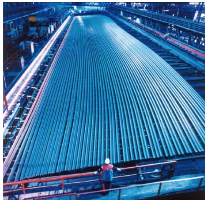
High speed turnouts and switches for the modernisation of turkish rail tracks.

Turkish State Railways wants to make use of advanced technology for expanding its rail network to cope with the rapidly increasing demand for transportation. The initial investment for the turnout production is EUR 10 million. In this first stage of expansion already 140 people will be employed. voestalpine will have a 51 percent share in the joint venture and will bring in the technological know how. Turkish rail producer Kardemir will have a share of 34 percent and Turkish State Railways 15 percent.