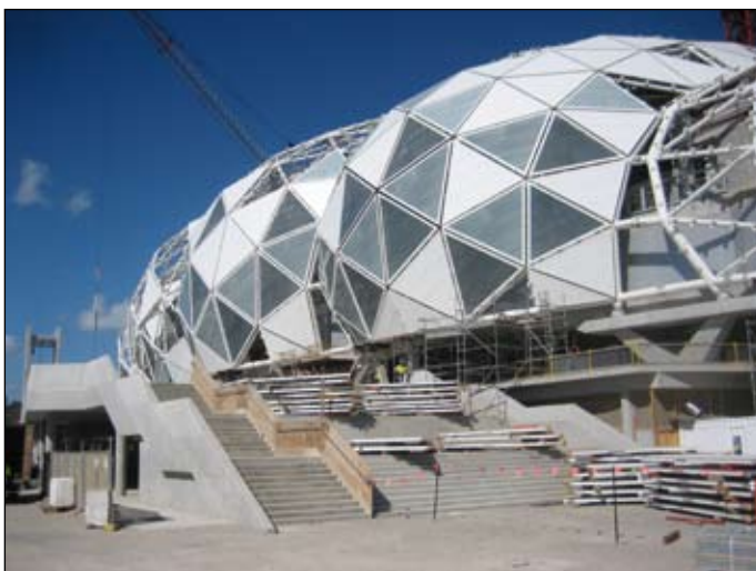
The new stadium was inaugurated on May 7, when the Australian rugby league team met the New Zealand national side.

The roof of the Melbourne stadium is made of 100-millimeter-thick isowand vario elements weighing under 13 kilograms per square meter. The elements were cut into equilateral triangles and fitted with aluminum frames by Melbourne based Minesco Pty. Ltd. and then delivered ready for assembly to the construction site. Rubber seals, also fitted by Minesco engineers before installation, ensure that the roof structure is waterproof. ThyssenKrupp Steel Europe realized the "whisper white" shade selected by the architects using a PVDF coating (polyvinylidene fluoride). The plastic layer is 25 micrometers thick and - thanks to its high chemical and thermal resistance - will ensure that the surface remains impervious to the effects of environmental influences and sunlight.