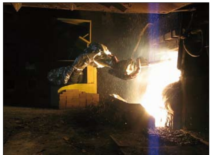
The Siemens LiquiRob robot system in action at the electric arc furnace of SAM Neuves-Maisons, Riva, France.

The robot system is operated and monitored from a central control room. Siemens was responsible for integrating the LiquiRob System into the existing Dog house and the EAF automation system, as well as for commissioning, and training the operating personnel. The solution implemented in Neuves-Maisons also includes installation of three automated magazines to store the sample and measuring probes, which can be safely filled by the operating personnel one time per day outside the dog house. The sampling and measuring procedures can be run auto-