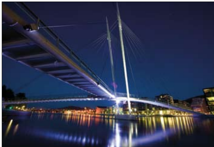
During late 2009, the company agreed on deliveries for some 15 bridges in different countries.

The foundation piles will be made at Ruukki's Oulainen unit in Finland and deliveries will begin in April. Fabrication of the load-bearing steel structures will begin in summer 2010 at the Ylivieska unit and installation will start in autumn 2010. The new Pekkala bridge will open to traffic in 2012.