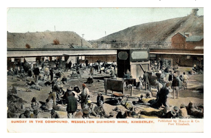
Figure 2. Postcard showing the compound of the Wesselton diamond mine in Kimberley, date unknown.

compounds (Figure 2).<sup>110</sup> She offers a brief discussion of the architecture, the salaries of the white managers and guards, the recruitment process, and the practice of the mining companies to set up stores inside the compounds. The argument that this took a profitable business away from Kimberley's merchants was the only protest uttered in the white community of Kimberley against the compounds.<sup>111</sup>