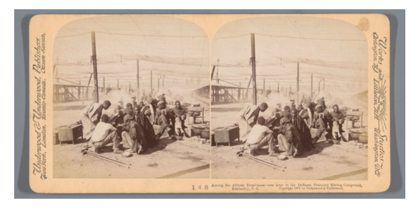
Figure 3. Stereograph by an anonymous photographer, 1901. The Dutch text reads: "Among the African Employees – rest hour in the De Beers Diamond Mining Compound, Kimberley, S.A.". Source: Rijksmuseum, Amsterdam, object number RP-F-F09042, public domain.