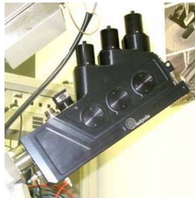
Fig.2. The overall view of OmniGIS™.