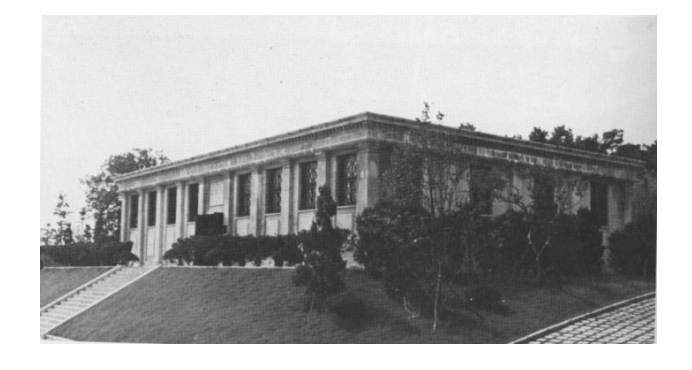
Hyŏnch'ungsa Reliquary 1973<sup>36</sup>