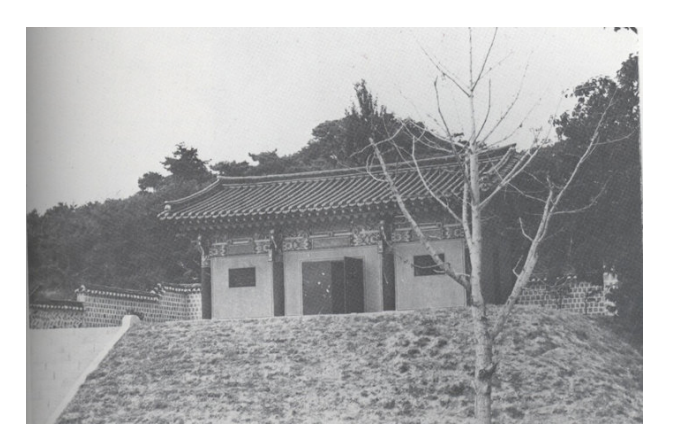
Hyŏnch'ungsa Reliquary 1968<sup>35</sup>