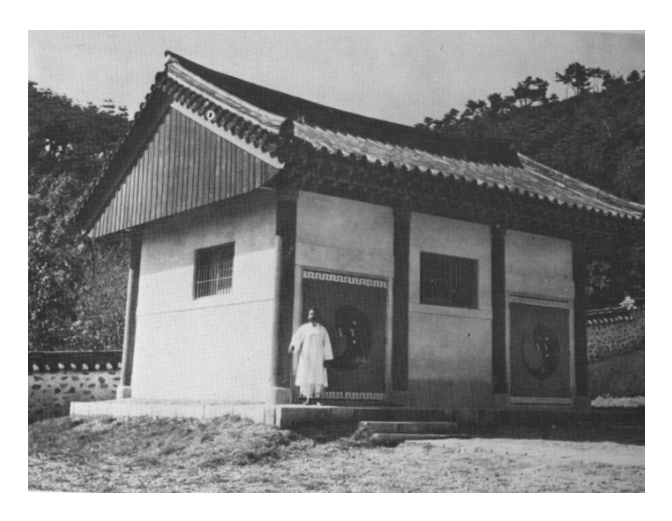
Hyŏnch'ungsa Reliquary 1962<sup>34</sup>

was a sharp contrast from the other traditional structures and preceding reliquaries. But in 1974, its external appearance was "Koreanized" through cosmetic changes-adding a new Chosŏn style tile roof with sloping eaves and newly painted mock columns to the structure. The new hybrid building perhaps better reflected the duality of the reliquary itself, as a museum dedicated to propagating a select image of the Admiral through the preservation of his writings and personal effects, and as a new institution that had no counterpart in the Choson past. Like the new shrine complex, the reliquary's legitimacy was founded on its claims about the past, yet it was a firm creation of the present.