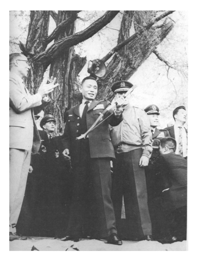
Chairman Park with a Chosŏn bow in 1962<sup>75</sup>

curved Chosŏn bow. Later photographs show a much more carefully staged affair, with the famously short president alone on an elevated stage, posing with a drawn bow for photographers and videographers.