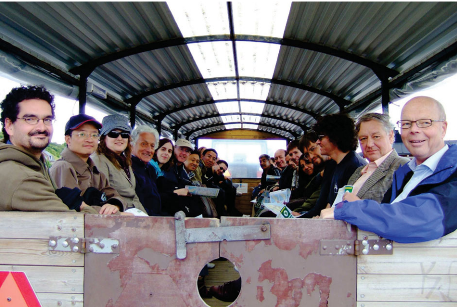
– and ending it: The Saturday excursion on the way to Uranienborg in one of the characteristic tractor-powered buses on Hven.