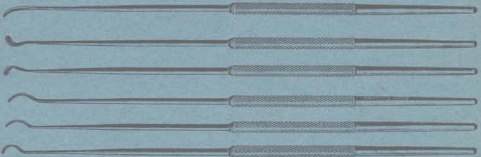
Set of 6 Dissectors