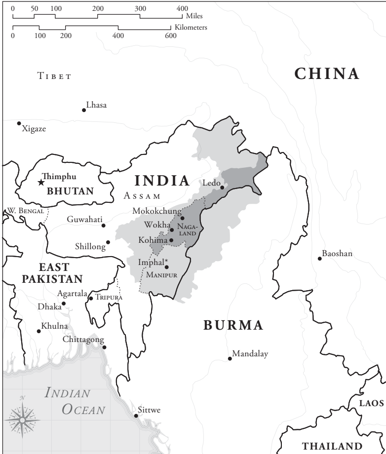
Administrative boundaries as of late 1961