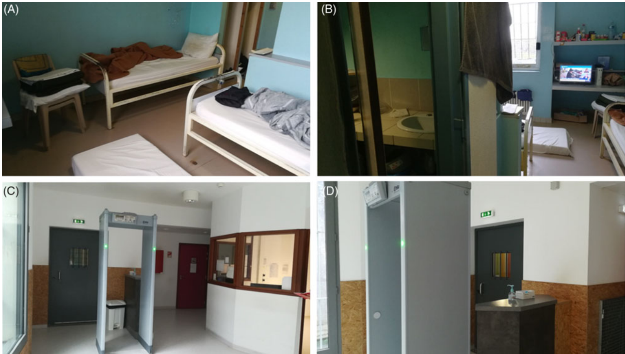
Fig. 1. Illustration of the promiscuity of cells and prison overcrowding. (A) A mattress is placed on the floor in a cell designed to accommodate 2 inmates. (B) The bathroom is small, cluttered and difficult to clean. (C) The health unit was reorganized to avoid COVID-19 transmission. (D) Inmates disinfect their hands and put on a mask as soon as they enter the health unit.

measures, the Brest detention center has not yet experienced a COVID-19 epidemic.