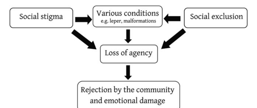
Figure 2. Mechanisms and social consequences of social exclusion. (Adapted and modified from Sekarningrum et al. 2017, 392.)

this study, such as human depictions on tomb walls and stelae from several periods. Through an emic approach, this source might provide insight into some aspects of non-canonical culture, but it is still a complicated task (Nyord 2020, 76–7; Silverman 2001).