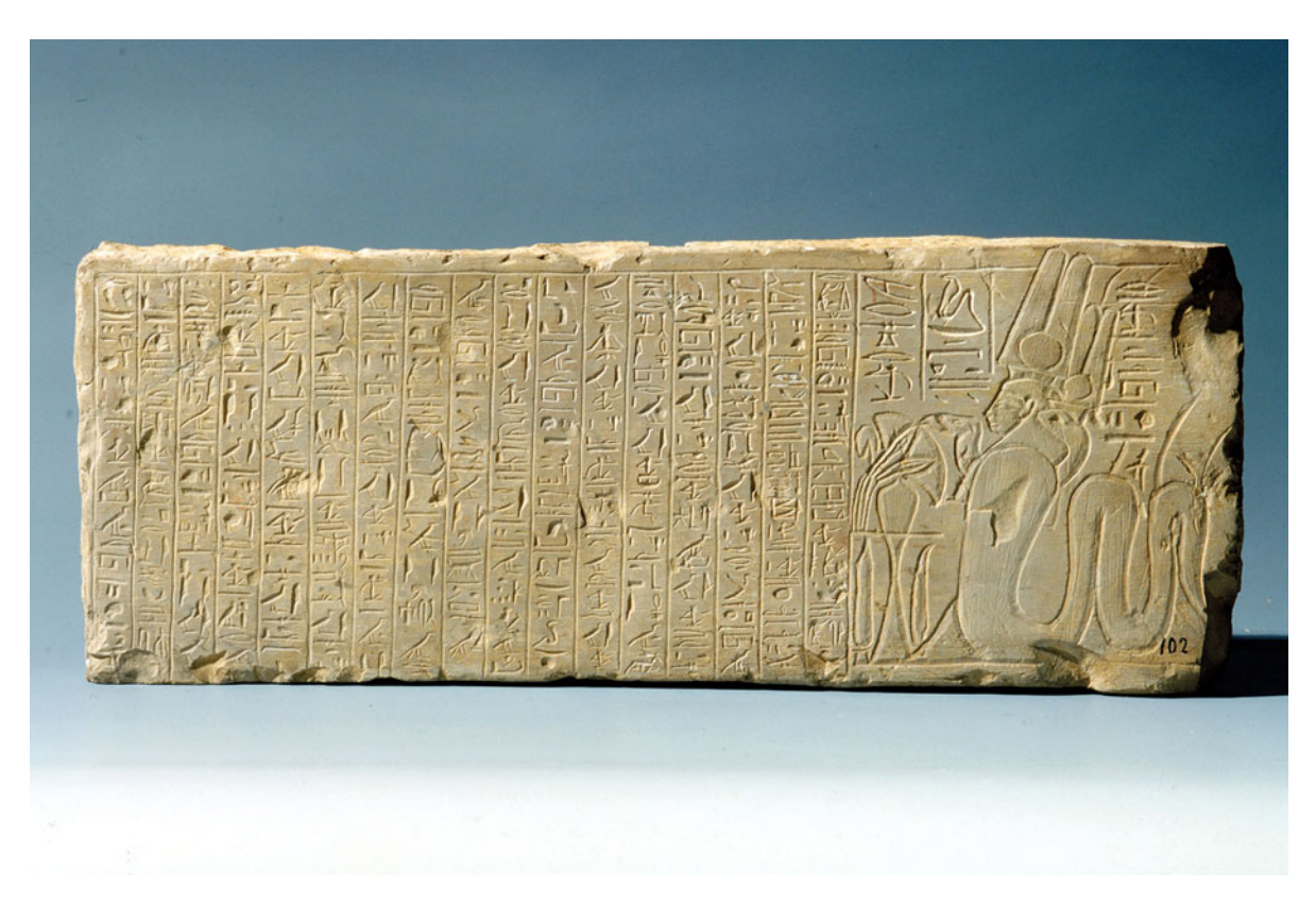
Figure 3. Neferabu stela (Turin CGT 50058) depicting Meretseger.

2443) record the obligation to menstruate ( lismn ) in the 'place of women' ( s ( t )- limt ). This phenomenon is not yet attested by archaeological evidence, but in the case of Deir el-Medina, this space would be outside the city, since a departure from it and the existence of three walls are mentioned (Wilfong 1999, 421–2). The lack of documentation of the practice of separating women during menstruation and, perhaps, childbirth does not imply that it was not common (Wilfong 1999, 428–9). Likewise, male relatives of menstruating women were to avoid working in tombs for the fear of contaminating those pure spaces (Pehal & Preininger Svobodová 2018, 116).