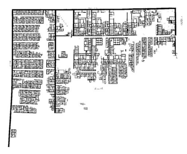
Figure 5. Town plan of Lahun, with the 'Great Prison' on the western area. (Adapted from W.M.F. Petrie, copyrighted free use [Wikimedia Commons].)

western part of the enclosure (Mazzone 2017, 24–30, 34–7). Moreover, it has been proposed that the contemporary work camp for agricultural labour at Qasr es-Sagha, an isolated site in the Fayum region, was probably created 'with a punitive intention' (Kemp 2018, 227–8, 238–9, fig. 5.18, with references). On the other hand, the case of Heit el-Gurob is a paradigmatic example of control, since the distribution of the houses and streets shows passages and corridors, as well as thick walls, that were meant to control the living population on the site, mainly workers (Lehner & Tavares 2010).