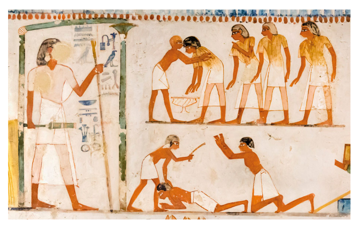
Figure 4. Peasant punished in the presence of his master, from the tomb of Menna (Theban Tomb no. 69).

recounts that some of the perpetrators were forced to commit suicide. Moreover, the 'anonymous mummy E', a son of that monarch possibly involved in the plot, was ritually excluded from a dignified afterlife by being buried with both hands tied, without mummification (nor his name inscribed) and wrapped in ovicaprid skins (Borrego Gallardo 2016, 77, with references).