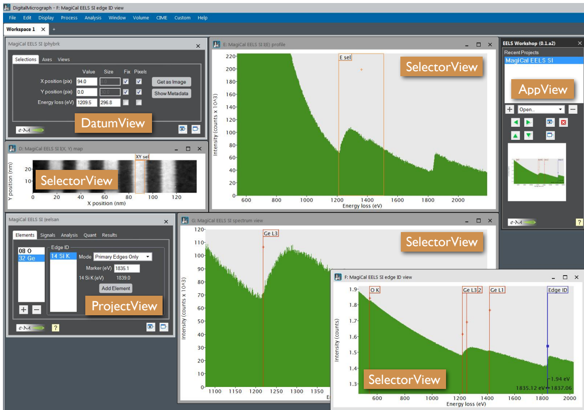
Figure 2. Snapshot of an active EELS spectrum image data set analysis using EELS Workshop, a typical realization of Enabler’s Workshop App design pattern. All view and ROI actions are conveyed to the project via the underlying network of controller objects depicted in the class diagram.