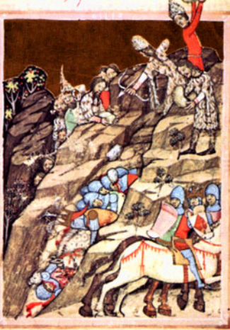
Figure 1. Chronicon Pictum, 14<sup>th</sup>-century illuminated manuscript now in the National Széchény Library in Budapest, page 143, with illumination showing the battle between the Hungarian army of King Charles I and the Vlachs (1330). Source: Wikimedia Commons, the free media repository.

fuam geneem infammanie A p aicht clea canum effectus folu tus a feato liganis è inbant at fepultus inmfino muico er titit fabula a infiolib: oufinlia. Tam enorme facum uno pie : un cromur accelife. Inucula: quo ilhio accidir. ver hamlus' ucinas plins naugauit. 7 cm pancia mans equoza fue fonie canna apuotum fulcanit. Se tam fortuna intbil aufa fane uale fanens tema unt, qz unoi or bellis infingentity fua arpe Dico uncebatur: Desui cua: ac manuum colore mimio tor quebatur. Rer uavit ai creatu contra Bazantaab.