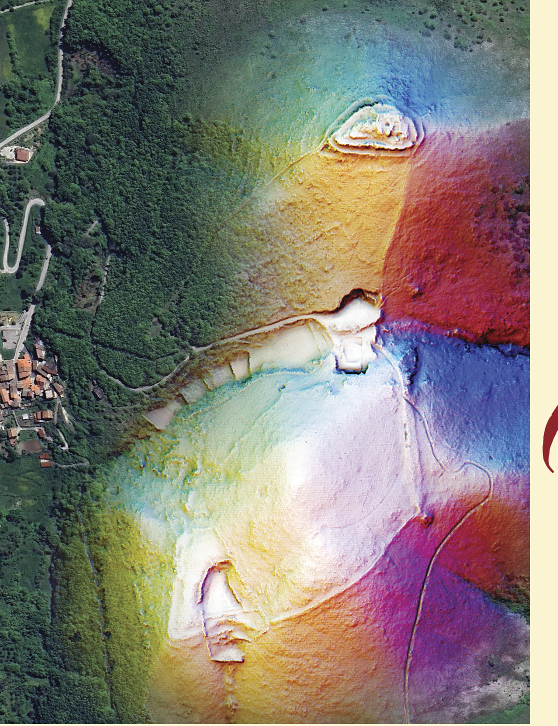
www.antiquity.ac.uk Volume 98 • Number 402 • December 2024