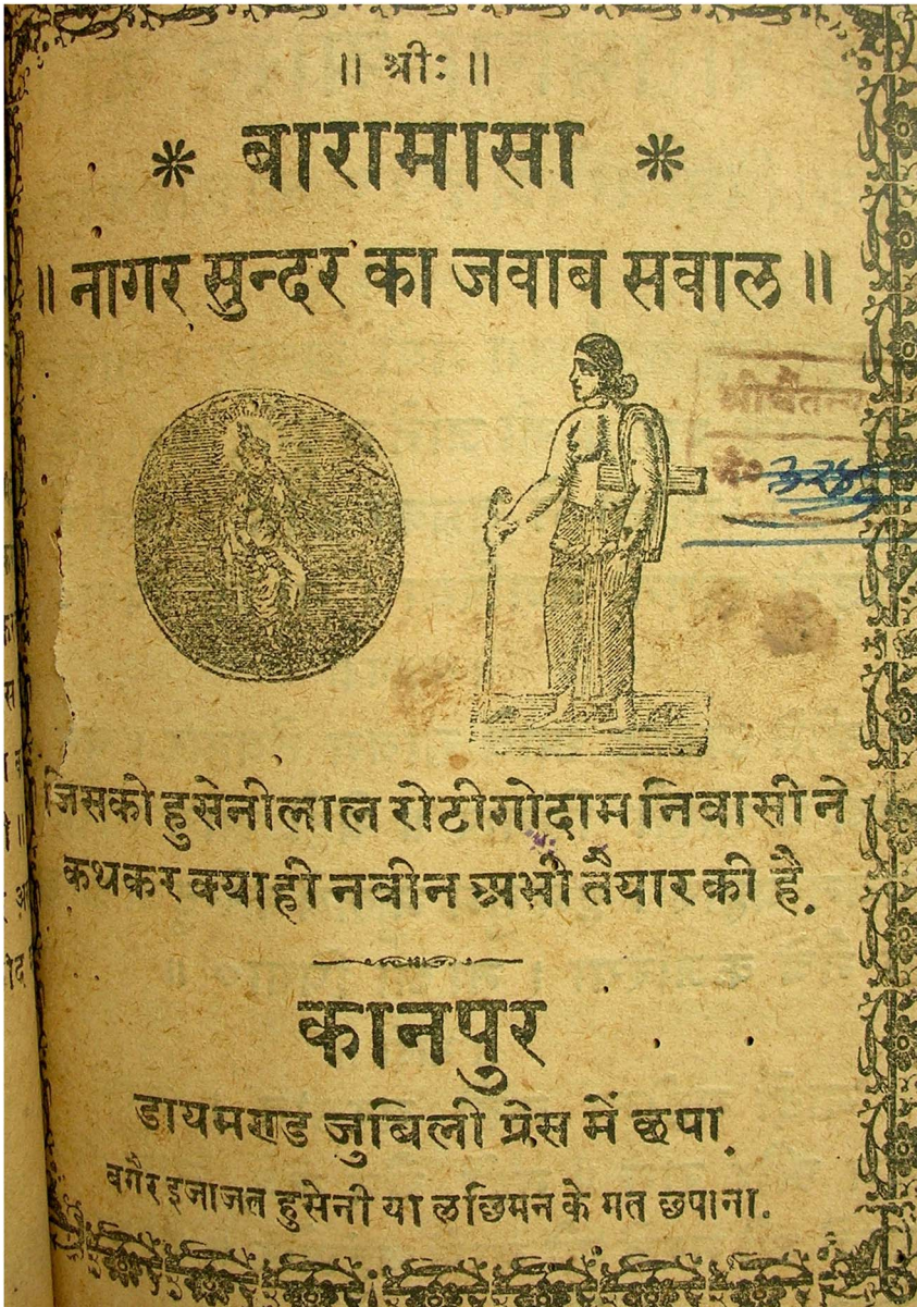
Figure 2. Hussaini Lal, Barahmasa: Naagar Sundar ka Jawab Sawal (Kanpur, s.a.)