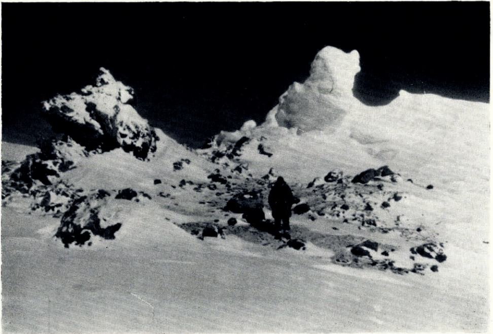
Fig. 1. Inactive fumarolic ice towers (1962)

Although the two parties took different routes, both traversed the extensive area of active and inactive fumaroles at 3,500 m. elevation on the north-west side of the mountain. The fumarole areas offer an unusual spectacle of large ice towers and mounds (Fig. 1). The towers vary in size but they are commonly 6 to 10 m. high and 3 or 4 m. or more in diameter. An aerial view (Fig. 2) shows that some towers have a roughly circular aperture in the crest. Many of the fumaroles were not active during 1962 and 1964, which is in contrast to the situation during the 1908 ascent (David and Priestley, 1914, p. 208-17), but in 1962 a few vents close to the ground were emitting gases. The ice towers are clearly formed by the