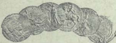
Gold Medal Allahabad 1910.

Paris 1900, Brussels 1910, Buenos Aires 1911.