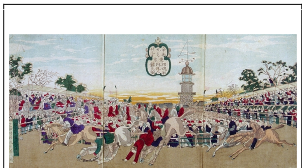
Tsukioka Yoshitoshi, Tokyo Shōkonsha Nai Gaijin Keiba, 1871.

made it all the more exciting for the spectators. 12