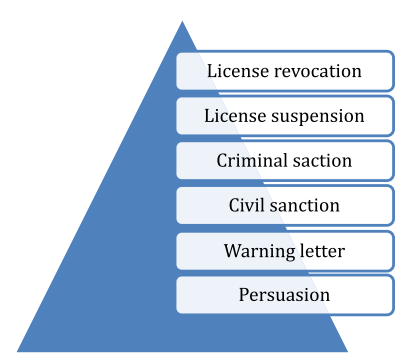
Figure 1. Enforcement pyramid.9

This is illustrated by Braithwaite's enforcement pyramid. Apart from being an escalation and de-escalation model, this pyramid also reflects how undertakings are distributed according to their willingness to comply. The behaviour of the largest group is at or near the base of norm conformity and benefits primarily from persuasion. The parties in the middle require deterrence. The number of parties that break the norms narrows as transgressions become more extreme and systematic, and at the top of pyramid, they are removed from the market. An example of this enforcement pyramid is replicated below (Figure 1). Other examples emphasise voluntary self-regulation, self-regulation on demand, and command and-control.