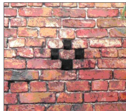
Figure 7. A tetravacancy.

I recently read Bleak House for the first time, my early exposure to Dickens having been limited to Oliver Twist , A Christmas Carol , and Great Expectations . It becomes immediately apparent, reading as an adult, that Dickens was a master of metaphor and simile. Not a page goes by without the coinage of a startlingly apposite comparison of some aspect of human behavior with some other familiar feature of 19th century life. The 21st-century scientist's equivalent tools tend to be analogies and models, but their purpose is the same—to make the topic clear and memorable.