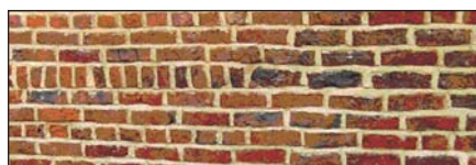
Figure 3. An edge dislocation with segregated large atoms.