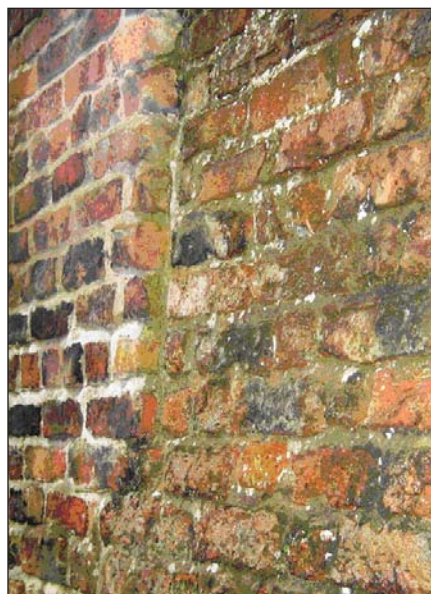
Figure 4. An emerging screw dislocation.