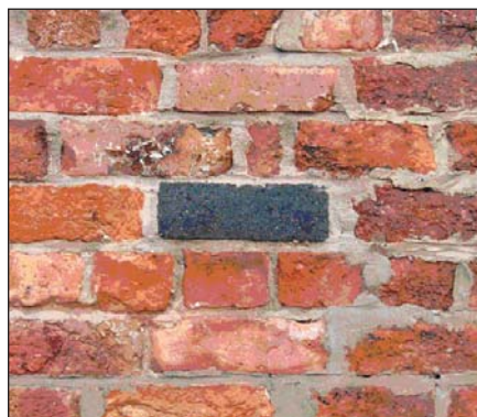
Figure 1. A substitutional atom.