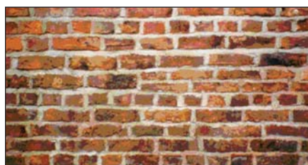
Figure 2. An edge dislocation.