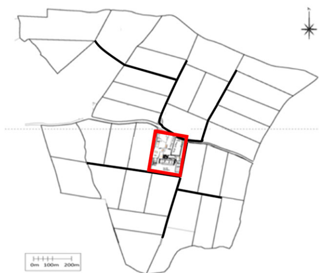
Figure 1. A layout of a pasture based dairy farm. An integrated farm roadway network and the farmyard location within the grazing platform. Red box: farmyard location. Figure sourced from Maher et al. (2023a).

access areas of pasture from farm roadways while reducing treading damage to the paddock. This involves the creation of narrow roadways (1–2 m wide) to allow the herd to access the furthest points of grazing paddocks without causing damage to areas already grazed. It has also been recommended that the furthest point from a roadway to the back of a paddock is no more than 250 m on dry land and 50–100 m on heavier soil types (Teagasc, 2021). Adding additional entry/exit points to paddocks reduces treading damage of a single entry/exit point which deteriorates the quality of the surface. This has been associated with increased lameness on pasture-based farms (Browne et al. , 2022a).