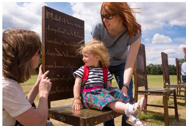
Fig. 3. Photograph by Max McClure of a chair from Hew Locke's The Jurors , reproduced courtesy of Situations 77

actually relate directly to courtroom trials, and, in each case, the evidence regarding the role of juries in assuring a just outcome is decidedly mixed. If it is true that Nelson Mandela was condemned to Robben Island without the benefit of a jury, that was certainly not the case with Oscar Wilde's imprisonment in Reading Gaol. 75 In the 1783 trials concerning the death of 133 African slaves thrown off the Zong by its crew, it was the jury who approved the owners' claim for compensation for the loss of "cargo," and the Lord Chief Justice who ordered the case to retrial. 76 Neither the images nor supporting texts convey anything of the problematic issues here. Meanwhile, the title, disposition, site and occasion of the work all associate the idea of jury trial with the rule of law in the struggle for freedom.