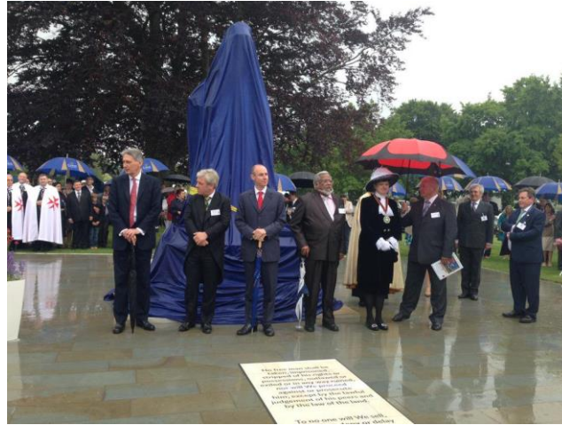
Fig. 4. The inauguration of James Butler’s statue to Queen Elizabeth II at Runnymede on June 14, 2015, reproduced by permission of Mirrorpix/Eleanor Davis. 83

does not guarantee justice any more than civil systems that function largely without them are by that token necessarily less just in their outcomes.