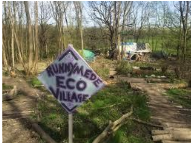
Fig. 5. The Runnymede Eco-Village, reproduced by permission of Diggers 2012. 92