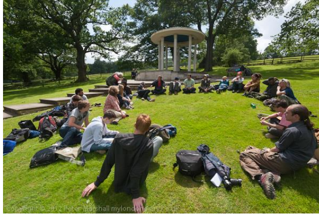
Fig. 1. “Magna”: Diggers and others near Runnymede Eco-Village, reproduced with the permission of Diggers2012 1

“Forget not, after all these years, The charter signed at Runnymede.” — Rudyard Kipling, “The Reeds at Runnymede” (1912)