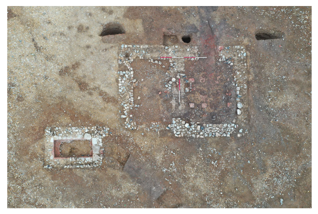
FIG. 28. Halesworth. Roman bathhouse, north to top.

of some wealth and status. A well-preserved pottery kiln (FIG. 29) shows that the inhabitants of this farm or estate centre made some of their own pots; wasters from the final, failed firing were still present.