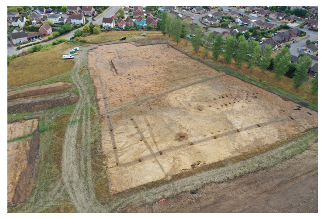
FIG. 27. Halesworth. Land at Chediston Street view east.

further to the east. A notable assemblage of pottery, animal bone and other artefacts was recovered from a ditch that formed the eastern boundary of the farmstead. 110