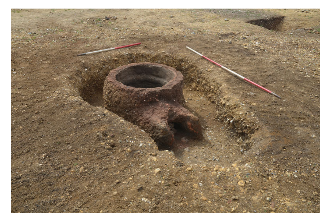
FIG. 29. Halesworth. Roman kiln, view south-west.

also included evidence of wooden inclusions together with fragments of timber from its waterlogged side ditches. Evidence suggested that the ditches could have been opened in the Iron Age but backfilled to reclaim land. Subsequent deposits from both sides of the causeway returned numerous small finds including three finger rings, two lead-alloy curse scrolls and 81 coins. The majority of the coins were of mid- to late fourth-century date, and were supplemented by late Nene Valley pottery sherds. In addition, the presence of a building was indicated to the east side by a large quantity of CBM. The road's path could then be traced for another kilometre with the aid of aerial imagery. 113