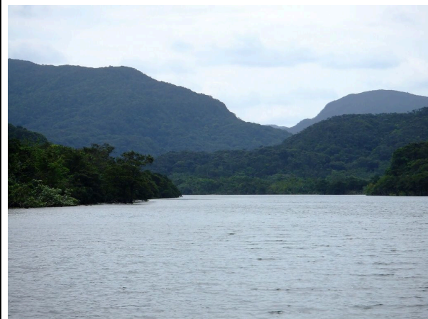
Urauchi River, Iriomote.

When his stiff body relaxed, little by little, in response to the tenderness of her breasts, a certain odd sentiment slowly spread within his body. It perhaps resembled the cool sensation poured from the skin of transparent water, the icy air felt in the first bodily contact with this world, or the tension experienced when being thrown into the endless sky. It was, as the story went, like the pain that permeated into one's entrails when torn apart by an object of desire.