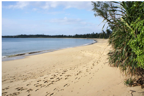
Tudumari-no-hama (Tsukigahama Beach).