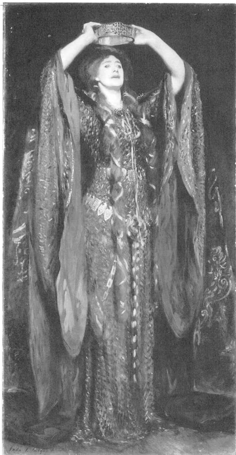
ELLEN TERRY AS LADY MACBETH (1889) by John Singer Sargent

(National Portrait Gallery, on loan from the Tate Gallery)