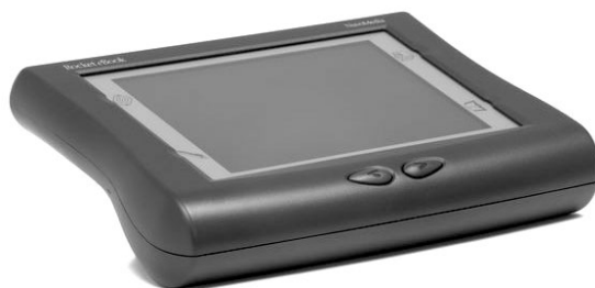
Figure I.1 Rocket eBook

them. This is not because it was love at first sight. I had commonplace opportunities to explore experiments in electronic publishing and squandered nearly all of them. Growing up, we had a family address book desktop-published using a GE TermiNet 1200 5 (when my father first became interested in desktop publishing in the 1970s, relevant reference books, such as Brian Kernighan and P. J. Plauger's Software Tools , 6 were sometimes sold with UNIX source code on an accompanying spool of magnetic tape). In my grade school library, CD ROM encyclopaedias sat next to the microfiche readers, and I found microfiche at least as intuitive and vastly more fun. I had a dim awareness of digital holdings in university library collections: things that weren't webpages but one would nevertheless read on screen (specifically, the screen of a humming dorm-computer-lab Macintosh Performa, or at best the candy-coloured clamshell of an iBook G3). But I have no memory of ever reading one myself, nor feeling any warmth or wariness or hostility towards these artefacts, nor having any opinion of any kind. Every encounter with the digital book hit the wall of my indifference and lack of imagination, until the Rocket eBook (Figure I.1).