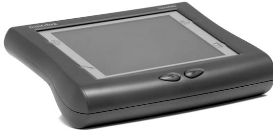
Figure I.1 Rocket eBook, © Mark Richards. Courtesy the Computer History Museum. www.computerhistory.org/revolution/mobile-computing/18/319/1721

them. This is not because it was love at first sight. I had commonplace opportunities to explore experiments in electronic publishing and squandered nearly all of them. Growing up, we had a family address book desktop-published using a GE TermiNet 1200 5 (when my father first became interested in desktop publishing in the 1970s, relevant reference books, such as Brian Kernighan and P. J. Plauger's Software Tools , 6 were sometimes sold with UNIX source code on an accompanying spool of magnetic tape). In my grade school library, CD ROM encyclopaedias sat next to the microfiche readers, and I found microfiche at least as intuitive and vastly more fun. I had a dim awareness of digital holdings in university library collections: things that weren't webpages but one would nevertheless read on screen (specifically, the screen of a humming dorm-computer-lab Macintosh Performa, or at best the candy-coloured clamshell of an iBook G3). But I have no memory of ever reading one myself, nor feeling any warmth or wariness or hostility towards these artefacts, nor having any opinion of any kind. Every encounter with the digital book hit the wall of my indifference and lack of imagination, until the Rocket eBook (Figure I.1).