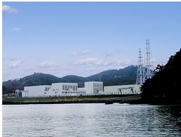
The Onagawa Nuclear Power Plant