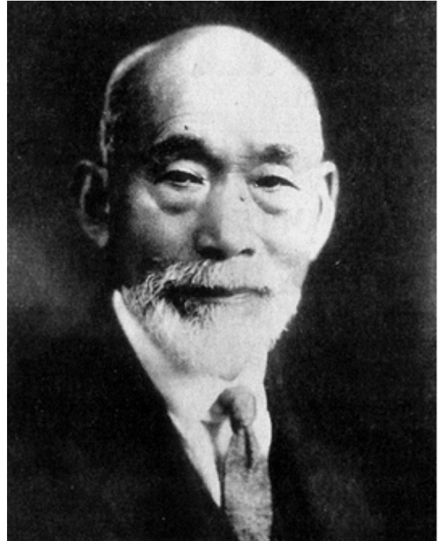
Zumoto Motosada, founder of The Japan Times 1

Keywords: Meiji-era Japanese propaganda, The Japan Times, Zumoto Motosada, Japanese Imperialism, Anglo-Japanese rapprochement, colonisation of Korea.