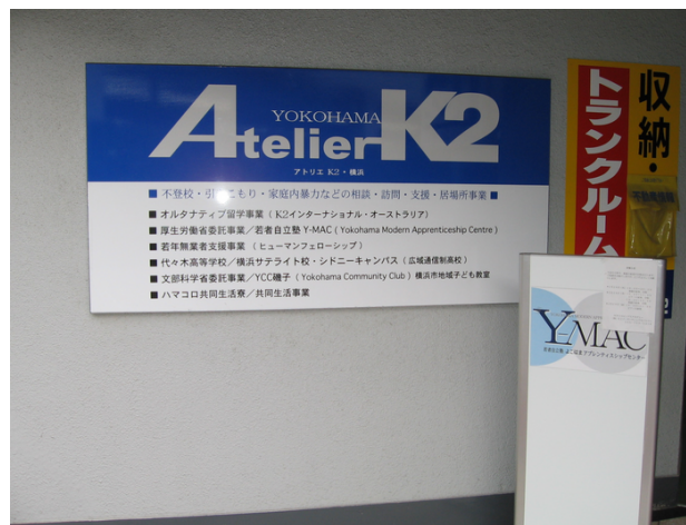
Entrance to K2

another, staff and local community members in a relaxed setting. The number of youth at the center hovers at around 25 and they are supported by a predominantly female staff of ten or so. On average, students are in their mid-twenties, with ages range between 13 and 34. They reside in shared rooms at nearby private houses.