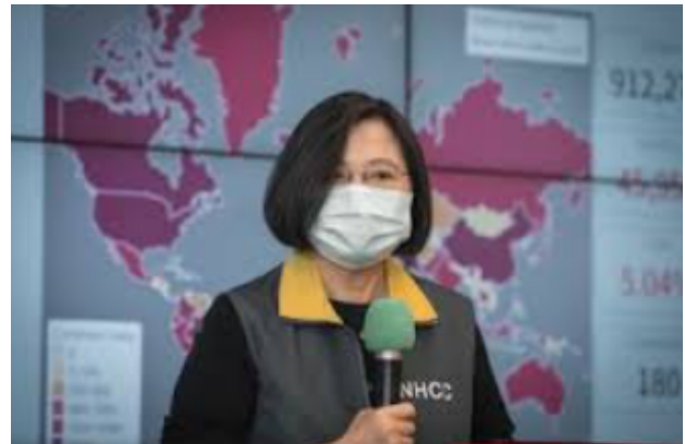
Taiwan President Tsai Ing-wen

Even the reliably pro-LDP Sankei recorded a 25 percent increase in public disapproval of Abe's crisis management between the end of March and mid-April, with sixty-four percent faulting Abe's handling of the virus outbreak. In declaring a limited state of emergency on April 7 Abe acknowledged the healthcare crisis, one that is a result in part of his unwarranted complacency about the pandemic. His complacency set the tone for the government's tardy crisis response, leaving Japan the laggard in East Asia. Compared to resolute regional leaders in Taiwan, South Korea, Singapore and Vietnam, Abe dithered and failed the COVID-19 leadership stress test.