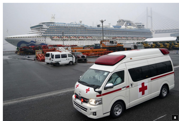
Ambulance in front of the Diamond

Thus, it is too soon to know the scale of the outbreak and the number of deaths due to COVID-19, but current figures are most likely underreporting the actual toll.