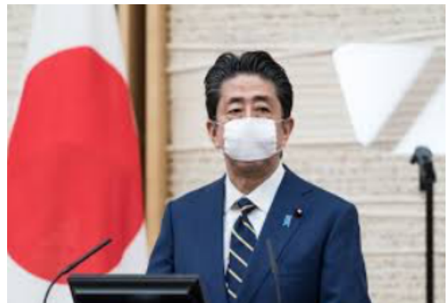
PM Abe declares National Emergency

Other fumbling world leaders are grateful for these relentless Trumpian blunders because he makes everyone look better, even dolts like President Bolsonaro of Brazil. But the disaster of Trump doesn't mean that we shouldn't scrutinize other leader's failings. A case in point is Japan's slow-motion train wreck.