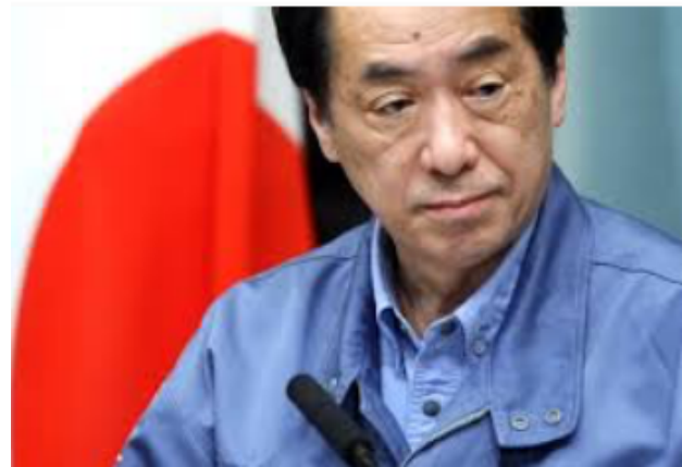
Prime Minister Kan Naoto 2011

The Golden Week holidays have started but without the usual frenetic rush to the exits transport overload. Trains and planes are empty and streets eerily quiet . This after a concerted campaign to get people to stay home and refrain from travelling during the holidays. This self-restraint is just what is needed to curb transmission and shows that political leaders can use the bully pulpit to jawbone public compliance. This time, Abe took his cue from Koike and in the runup to the Golden Week exodus frequently reinforced her message to stay home. What if Abe had acted sooner and used his high-profile platform to encourage social distancing and ramp up testing and tracing in February when the outbreak was just starting? Had he been bold, he might have done a great service to the nation.