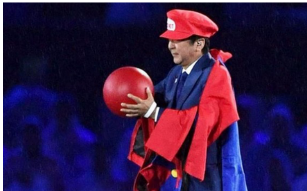
Abe as Super Mario at Rio 2016 Olympics closing ceremony

Keidanren appeared to have written the first draft of Abe's stimulus package and will play a crucial role in both mitigating the economic dislocation and in the timing of the exit from Japan's version of lockdown. In consultation with the Japanese Trade Union Federation (Rengo) and the government, Keidanren is encouraging member companies to maintain jobs by all possible means. Keidanren represents large enterprises, employing about 30 percent of the workforce, and they have vaults of cash that should help them ride out the pandemic. The situation is not so rosy for small and medium size firms where 70 percent of Japanese work . The government anticipates that the pandemic impact on unemployment may prove severe as shrinking demand at home and overseas will batter the economy. Suicide is a grim leading indicator of the misery index and is tragically on the rise .