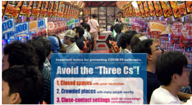
Pachinko Parlors remained open and packed

The Golden Week holidays have started but without the usual frenetic rush to the exits transport overload. Trains and planes are empty and streets eerily quiet . This after a concerted campaign to get people to stay home and refrain from travelling during the holidays. This self-restraint is just what is needed to curb transmission and shows that political leaders can use the bully pulpit to jawbone public compliance. This time, Abe took his cue from Koike and in the runup to the Golden Week exodus frequently reinforced her message to stay home. What if Abe had acted sooner and used his high-profile platform to encourage social distancing and ramp up testing and tracing in February when the outbreak was just starting? Had he been bold, he might have done a great service to the nation.