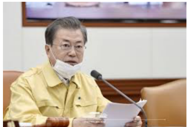
President Moon Jae-in's party won a landslide victory in April 2020

Clearly, President Moon has managed the outbreak much better than Abe and voters rewarded him in the recent parliamentary polls .