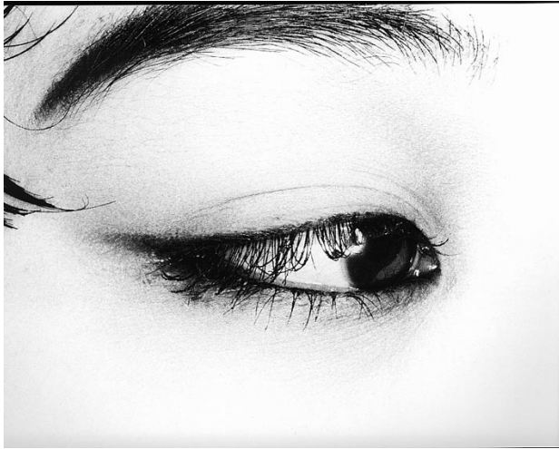
From the collection at the Barbican in London