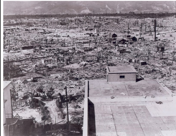
Hiroshima after the bomb. The view from the ground.

the ravages associated with radiation. 26 Finally, not only was the press tightly censored on atomic issues, but literature and the arts were also subject to rigorous control prior.