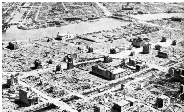
Aerial photo of Tokyo after the bombing of March 9-10.

The chief characteristic of the conflagration . . . was the presence of a fire front, an extended wall of fire moving to leeward, preceded by a mass of pre-heated, turbid, burning vapors . . . . The 28-mile-per-hour wind, measured a mile from the fire, increased to an estimated 55 miles at the perimeter, and probably more within. An extended fire swept over 15 square miles in 6 hours . . . . The area of the fire was nearly 100 percent burned; no structure or its contents escaped damage.