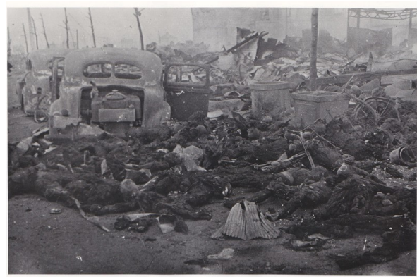
Bodies of people trapped and burned as they fled through a street during the attack on Tokyo on the night of March 9-10.