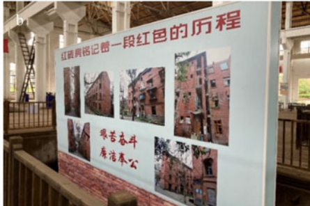
Figure 2. Exhibits in the Display. Source: Author, November 2020.

people of their collective experiences associated with the Third Front movement was a way to enhance people's attachment to the existing community so that they could defend their rights collectively in the face of the impending demolition. When the district government announced its plan to expropriate housing and relocate residents, quite a few open letters, written by local residents, were posted in the neighbourhood. Some of these letters underscored Qiancao's unique relationship to the Third Front, as articulated in a letter endorsed by "the majority of Qiancao residents":