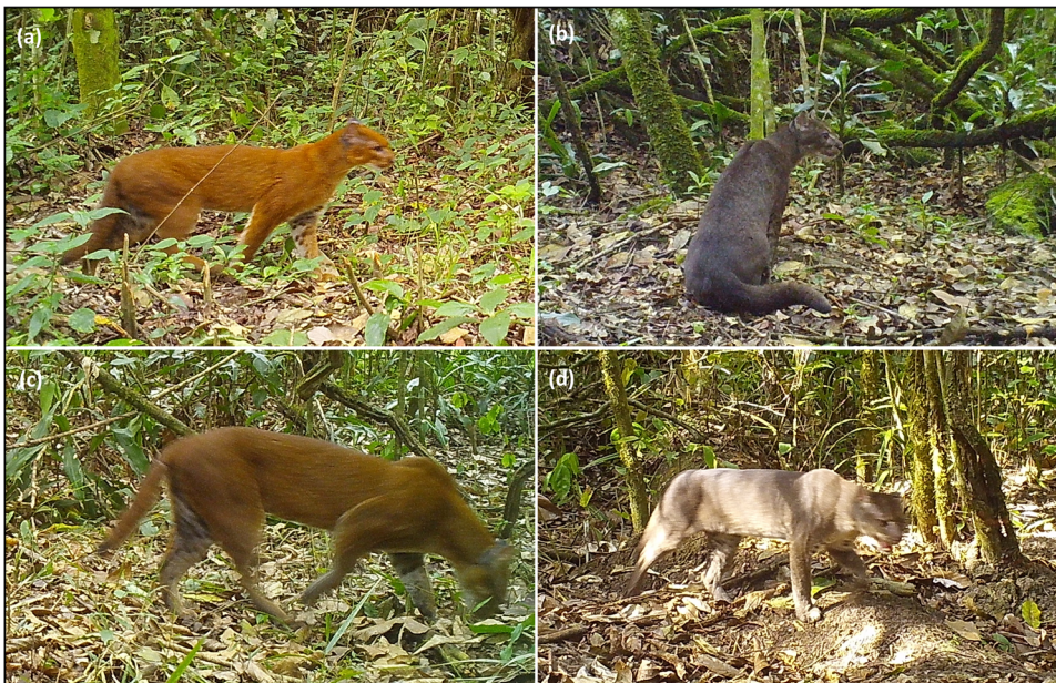
PLATE 1 African golden cat Caracal aurata photo-trapped in Minziro Nature Forest Reserve, Tanzania. The survey revealed golden/brown-reddish (a, c) and dark/light grey (b, d) morphotypes.

Our findings suggest that habitat intactness and human disturbance affect golden cat occurrence, with increased occupancy with increasing distance from the Reserve border