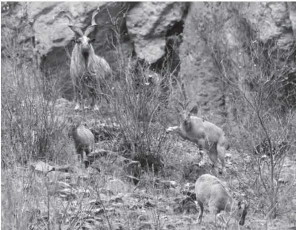
PLATE 1 Markhor Capra falconeri heptneri feeding on redbud Cercis griffithii .

*In 34 of these groups subadult males were also present