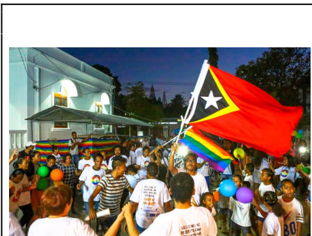
Timor-Leste's first LGBT+ Pride Parade, Dili, 2017

With no fear they will be tortured by the Police