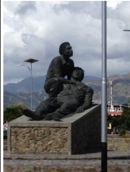
Memorial to the 1991 Santa Cruz massacre, Dili, 2015

The Dadolin Murak poem above reminds me of the Santa Cruz Cemetery I visited in May last year (2016). This is one of the best known cemeteries in the world. On this site, about a quarter of a century ago (in 1991) there was a brutal massacre of hundreds of Timorese civilians.