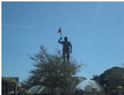
Statue of Nicolau Lobato, Dili, 2017

You even forced us to memorize the number of feathers on the Garuda's wings 10