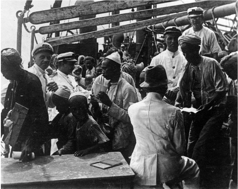
Figure 1.1 Passport control on a Dutch pilgrim ship, c. 1910–40.

Source: Collection Nationaal Museum van Wereldculturen, Coll. no. TM-10001256.