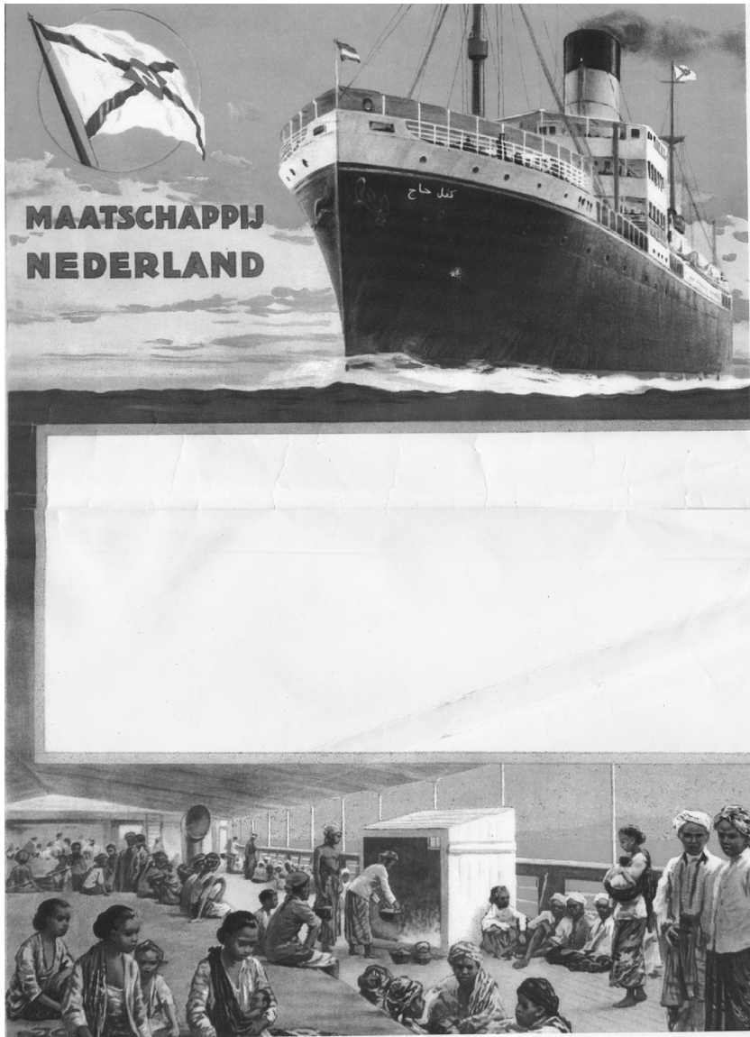
Figure 1.2 Kongsi Tiga advertisement poster, c. 1920–40.