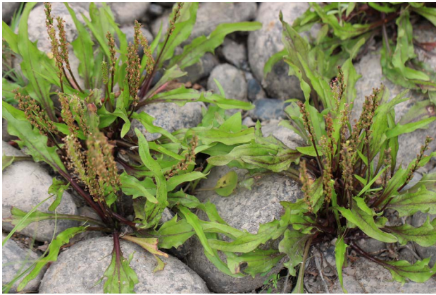
Plantago fengdouensis (Z.E. Chao & Yong Wang) Yong Wang & Z. Yu Li in Jiangnan County.

was considered the only herb that became extinct as a result of the construction of the Three Gorges Dam. The Shenzhou XIII manned spacecraft carried seeds of the species for mutation breeding in November 2021, but the seeds returned from space had a low germination rate.