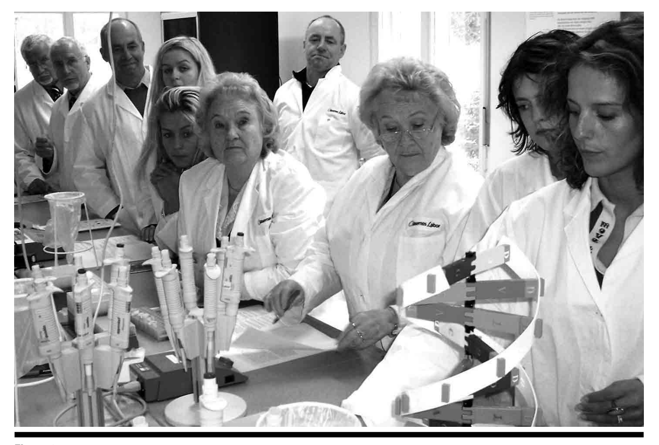
Figure 2 Genetics laboratory.

functional assays to determine venous function, for example (Brinsuk et al., 2004). Molecular phenotyping has been included in one study in which the percentage of neutrophils expressing Proteinase 3 on their cell surface was counted (Schreiber et al., 2003). Gene expression assays measuring gene activity as an intermediate phenotype are currently under way.