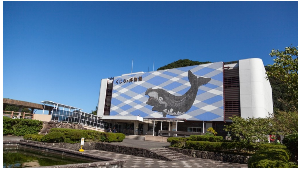
The Taiji Whale Museum (photo by the author).

To say that Japanese whaling has been controversial during the past three decades would be an understatement, but how have international and domestic anti-whaling movements played into the recent decision of the Japanese government to withdraw from the IWC? To answer this question, let us start with Taiji, the only whaling community widely known outside of Japan. Overlooking the picturesque Kii peninsula coastline, Taiji is perfectly located to watch migrating whales swimming along the Japanese coast. Its whaling history reaches as far back as 1606, when the first whaling group was established to hunt right whales ( Eubalaena japonica ).