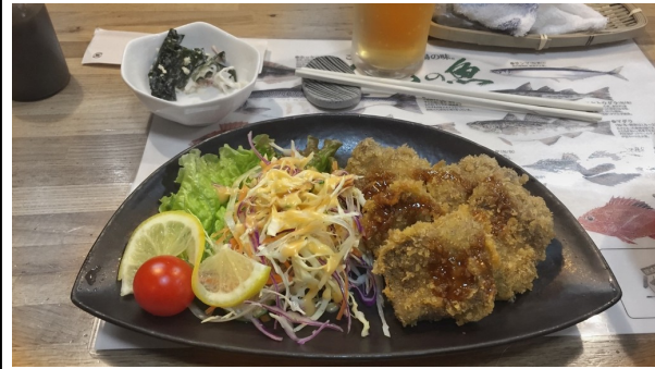
Fried whale meat dish in Kushiro (photo by the author).

Our visit to the last “whaling town” brings us to the icy coast of the Okhotsk Sea in northeastern Hokkaido. In the summer, several whale species travel thousands of miles along the Japanese Pacific coast to reach these waters and feed on plankton and small fish. Long before the first Japanese or even Ainu reached this northern region, the indigenous Okhotsk people hunted whales here. Visitors to Abashiri, a fishing city of around 35,000 inhabitants, come mostly to sightsee at the prison museum, which preserves the original buildings of Japan’s most infamous prison from the Meiji period, or watch the drift ice. Unlike the other whaling communities, walking through the city streets gives little indication that this city has a deeper connection to whales: there are no restaurants praising whale meat and no manholes with whale motifs. Only when reaching the harbor do you find whale posters, but these whales are not for eating. Instead, these posters are for the newest tourist attraction: whale watching.