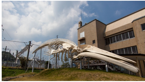
Blue whale skeleton in Wadaira.

Taiji highlights how regional politics and culture have played a crucial role in resuming commercial whaling, but why did the government end whaling operations in the Antarctic Ocean and what does this change mean for current coastal whaling operations? To find the answers to these questions, let us travel to the Kanto region and the “whaling town” of Wadaira.