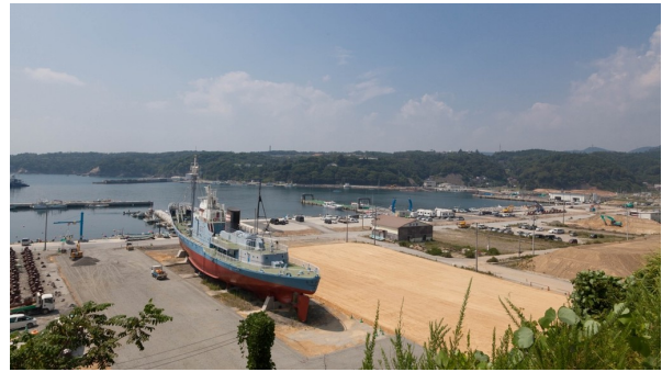
Ayukawa after the Tsunami.