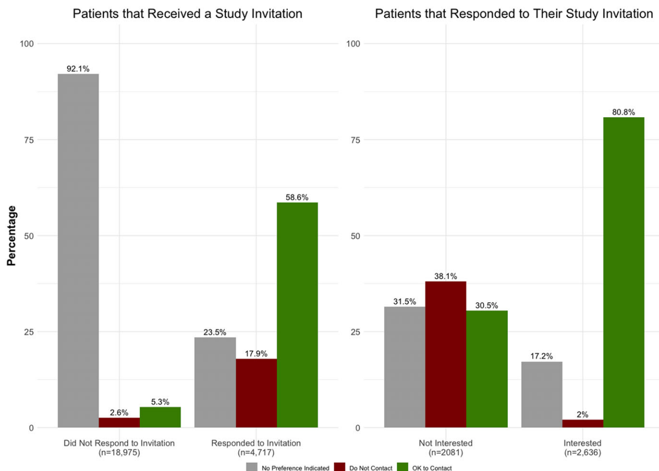
Figure 1. Patient contact preference after receiving a research invitation by patient response and interest to the research study. Note: Percentage of contact preference is per response/interest group. Contact preference is the most recent preference individuals made after receiving a research invitation. Only individuals with a contact preference of “OK to Contact” or “No Preference Indicated” were sent an invitation to begin with.

enhancing geographical and demographic diversity. The range of diverse research studies, each with differing study designs and criteria, further enriched the program’s scope and applicability. Furthermore, the nature of the recruitment method is efficient and convenient, enables timely communication, and enhances EHR data integration.