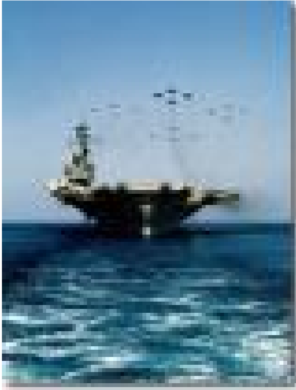
The U.S. Seventh Fleet patrols the Indian Ocean and Western Pacific

However, there are drawbacks to aligning too closely with either power for India. On energy security, India and China have found cooperation to be easy in Iran, but, as finding new sources of oil becomes more difficult, there are bound to be areas of friction. For example, China views the Andaman Sea off Myanmar's coast as an important source of oil to fuel the economic expansion of China's western provinces. However, New Delhi sees building a port at Dawei, Myanmar as a major component to its future security strategy for the region. China's presence in the area is an unwelcome development for India.